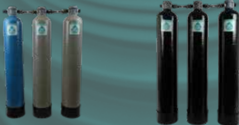
Tri Bed Business Tri Bed Ultra