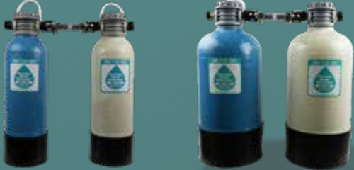
Dual Bed Standard Dual Bed Double Standard