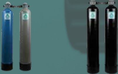
Dual Bed Business Dual Bed Ultra