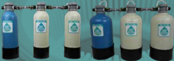
Tri Bed Standard Tri Bed Double Standard